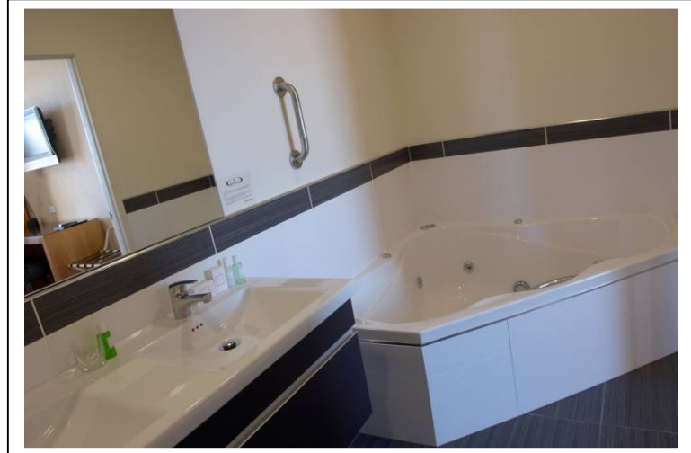
2 x Corporate Suite