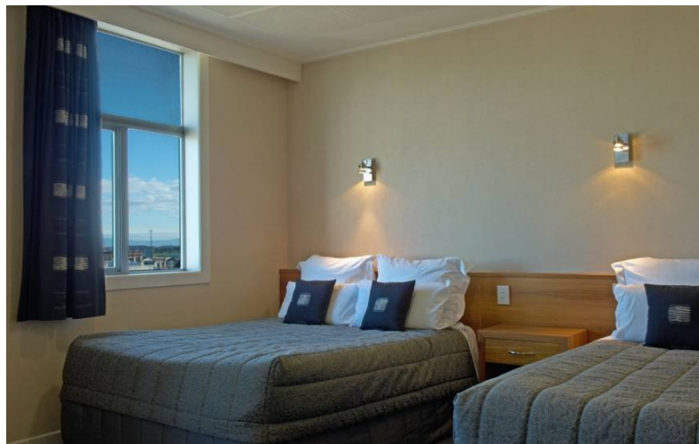
57 x Standard Rooms